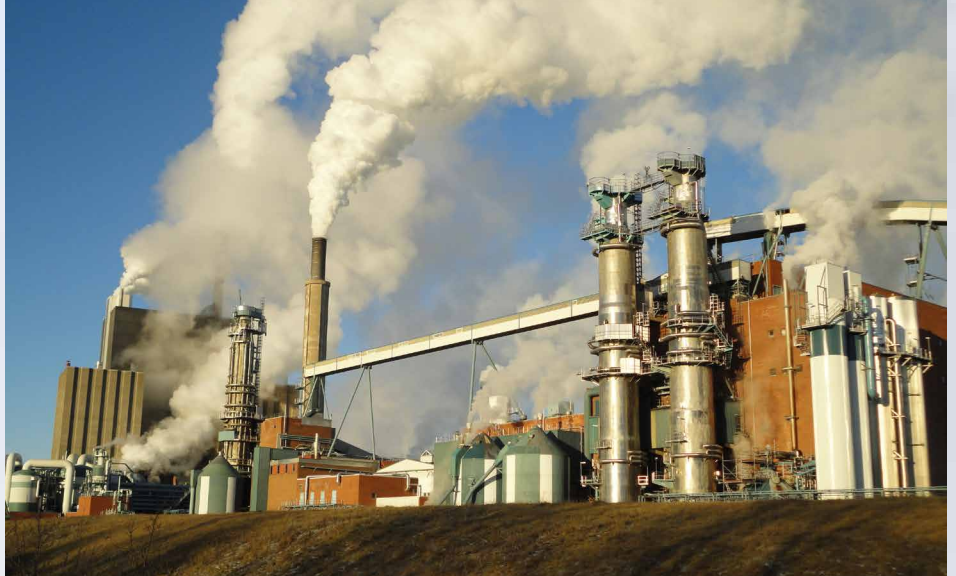
Skutskär pulp mill, Sweden

Shaft diameter: d_1 = 50 \dots 150 \text{ mm} (1,940" ... 6,000") Pressure: p_1 = 10 \text{ bar} (145 PSI) Temperature: t = -40 \text{ °C} \dots +150 \text{ °C} (-40 °F ... +300 °F), above 80 °C (175 °F) flush is recommended Sliding velocity: v_g = 10 \text{ m/s} (33 ft/s) Axial movement: \pm 1.5 \text{ mm} (1/16") Radial movement: \pm 0.8 \text{ mm} (1/32")