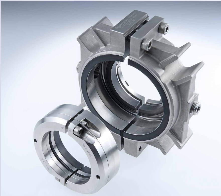
Splitex fully split seal